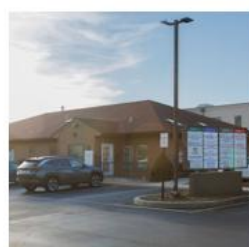
Deborah Specialty Physicians at Toms River –Professional Building, Toms River, NJ