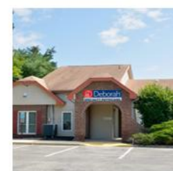
Deborah Specialty Physicians at Whiting, Whiting, NJ