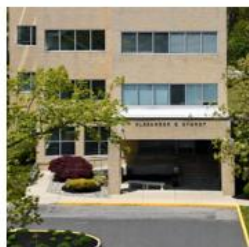
Cymrot Building, Browns Mills, NJ