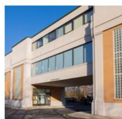
Deborah Specialty Physicians at Toms River – Cory Building, Toms River, NJ