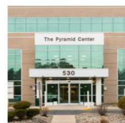
Deborah Specialty Physicians at Toms River –Pyramid Building, Toms River, NJ