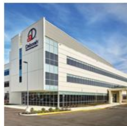
Medical Office Building, Browns Mills, NJ