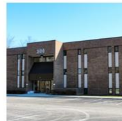
Deborah Specialty Physicians at Lawrenceville, Lawrenceville, NJ