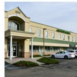
Deborah Specialty Physicians at Manahawkin, Manahawkin, NJ