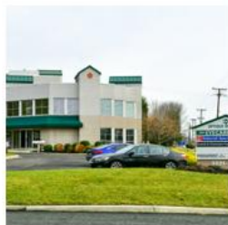
Deborah Specialty Physicians at Mt. Laurel, Mt. Laurel, NJ