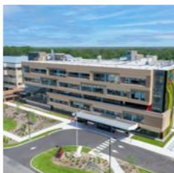
Deborah Heart and Lung Center, Browns Mills, NJ