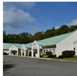
Deborah Specialty Physicians at Galloway, Galloway, NJ